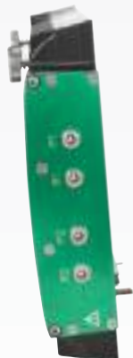
2 ch. UT2