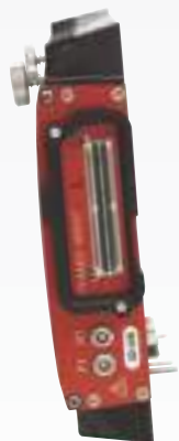
PA2 16:64 PA2 32:128 PA2 16:128 PA2 32:128PR