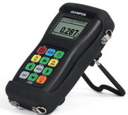
27MG with the optional Protective Rubber Boot with Neck Strap and Gage Stand

Standard inclusions may vary depending on your location. Contact your local distributor.