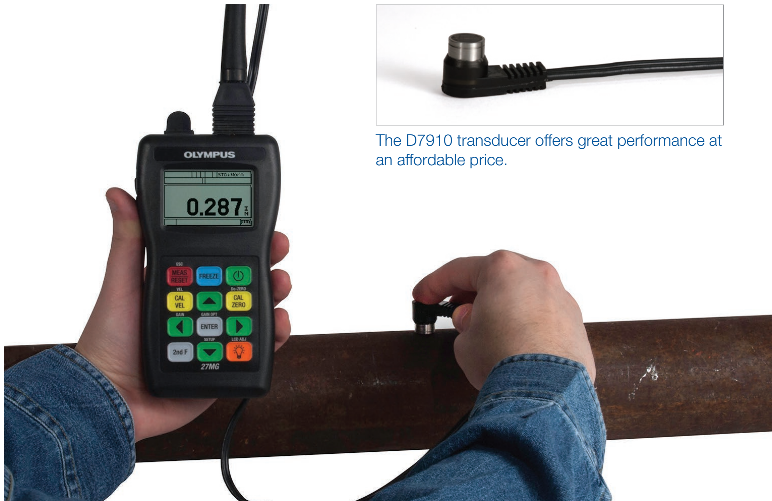
The D7910 transducer offers great performance at an affordable price.

The 27MG thickness gages comes standard with the low-cost D7910 dual element transducer that enables you to make thickness measurements for many basic corrosion applications. For measurements on very thin or thick materials, or small diameter pipes, Olympus has a full line of dual element transducers. Olympus transducers compatible with the 27MG gage feature Automatic Probe Recognition that optimizes transducer performance by automatically recalling the default V-path correction.